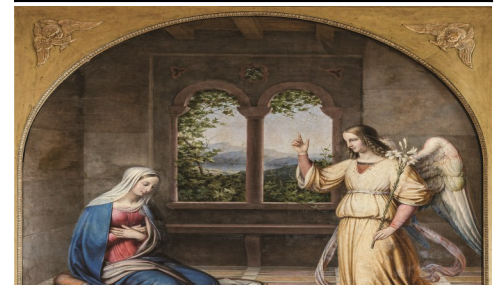
The Feast of the Annunciation Fiesta de la Anunciación