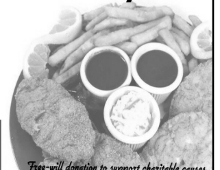
Free-will donation to support charitable causes